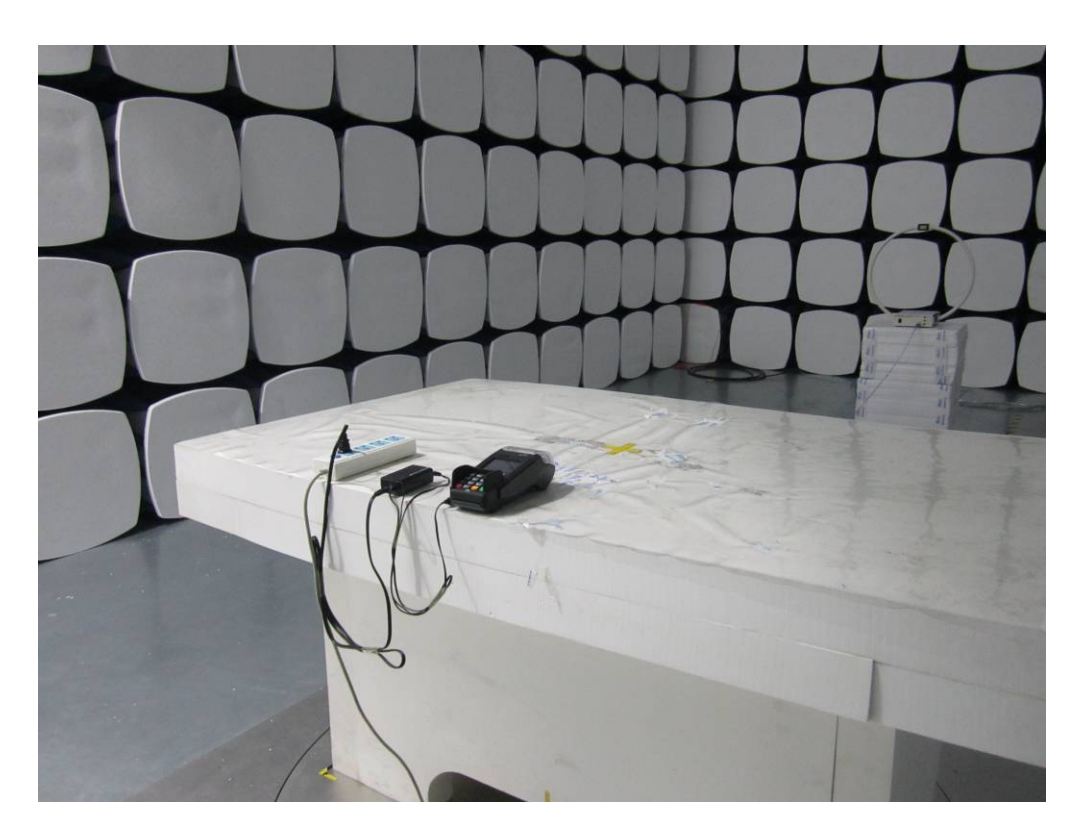
Radiated Spurious Emissions Test Setup Below 30MHz - Front View

Report No: 14070371-FCC-R1 Issue Date: August 11, 2014 Page: 37 of 43 www.siemic.com www.siemic.com.cn