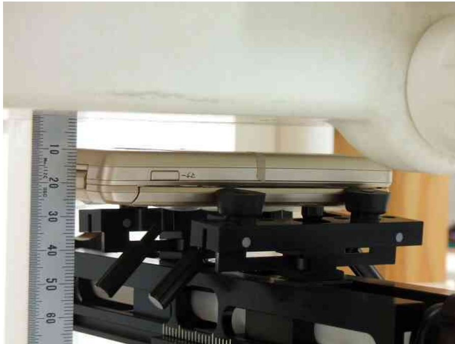
– Rear –