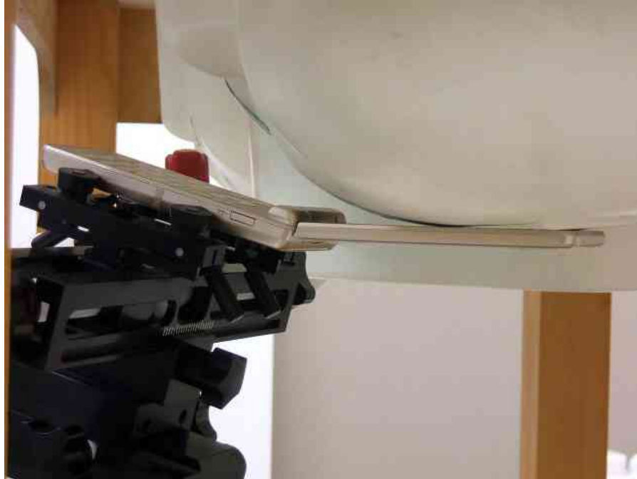
– Cheek-Touch Position –