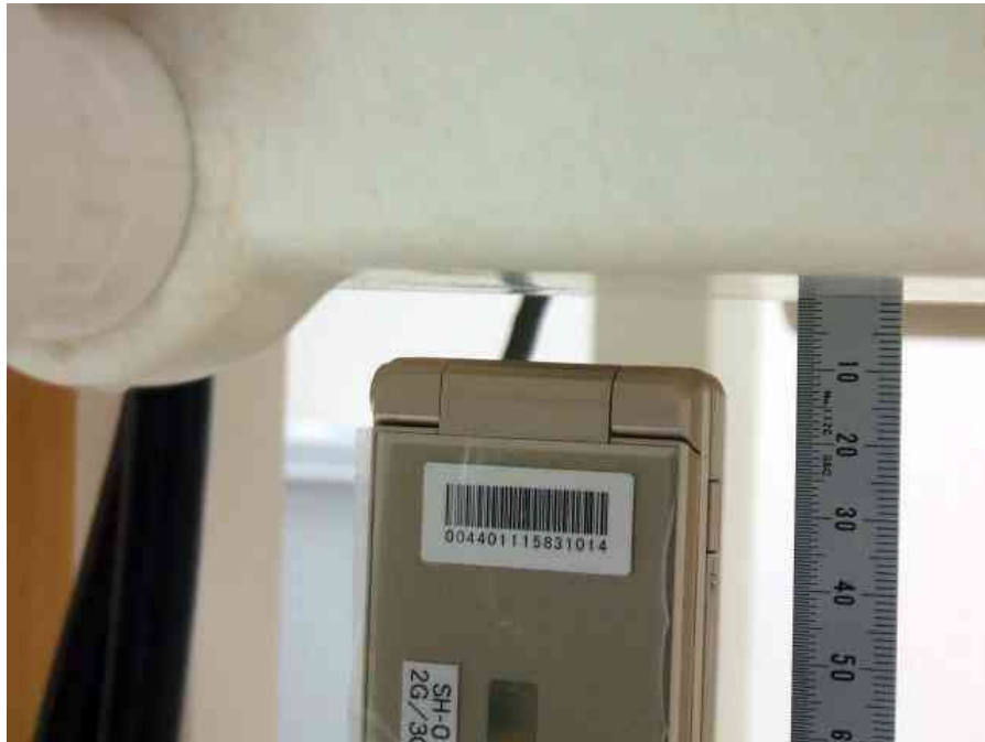
–Edge 1 (Top) –