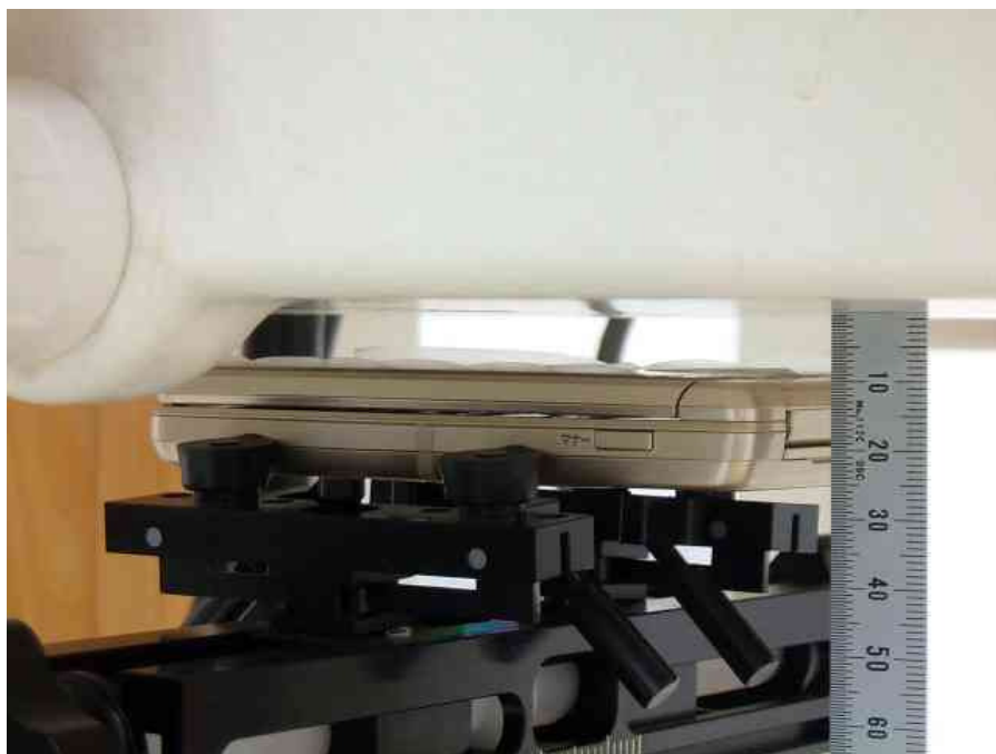
– Front –