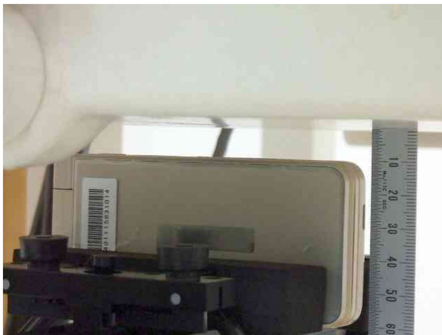
– Edge 2 (Right) –