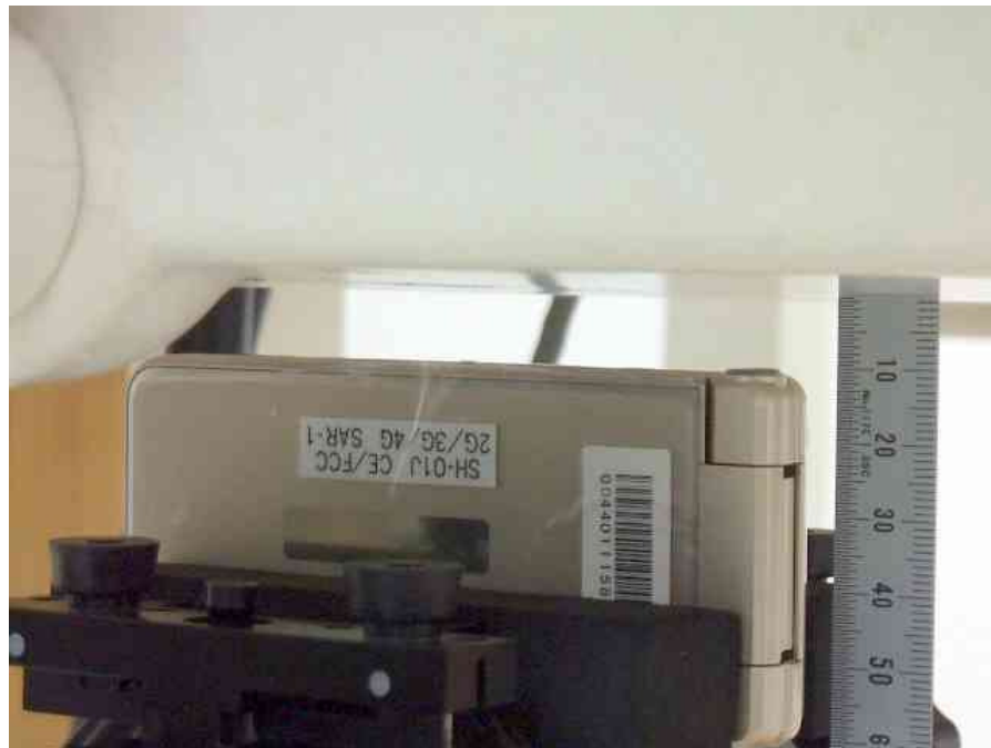
– Edge 4 (Left) –