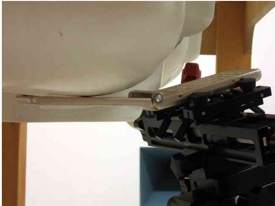
– Cheek-Touch Position –