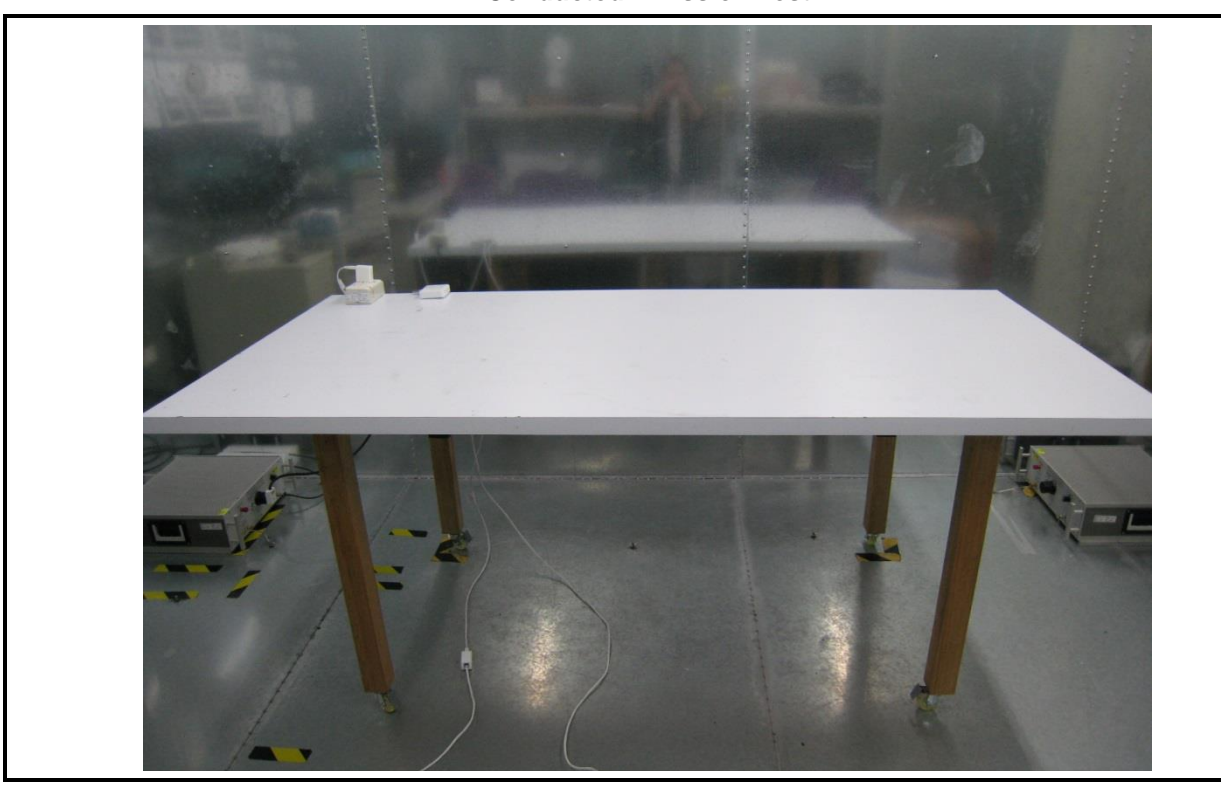
Conducted Emission Test