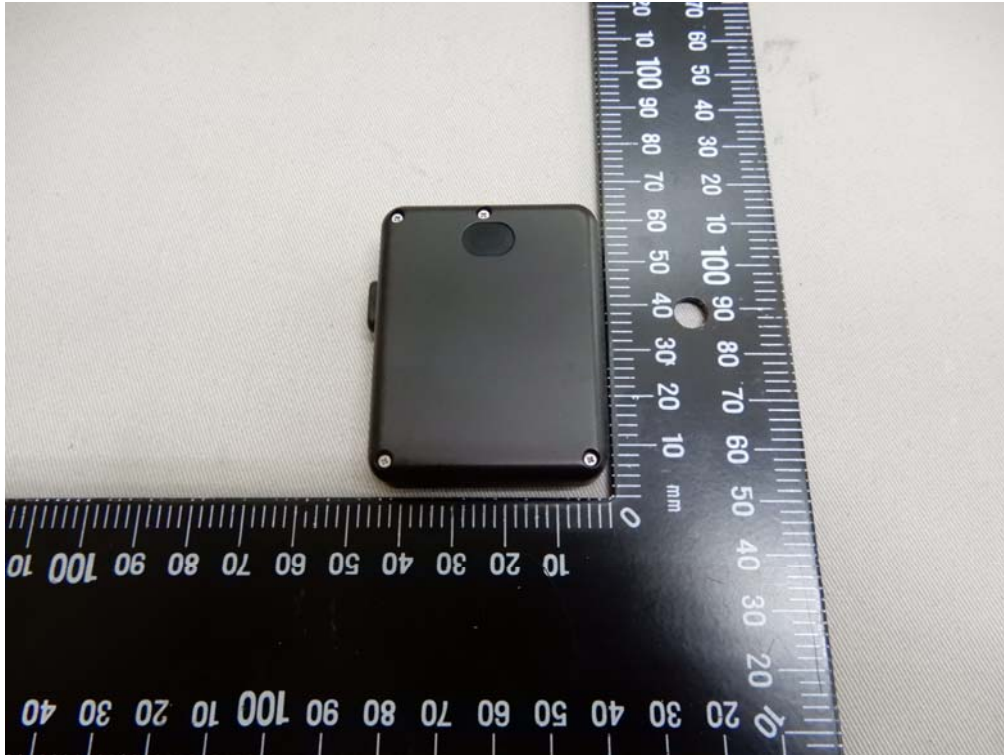
Side View of EUT – 1