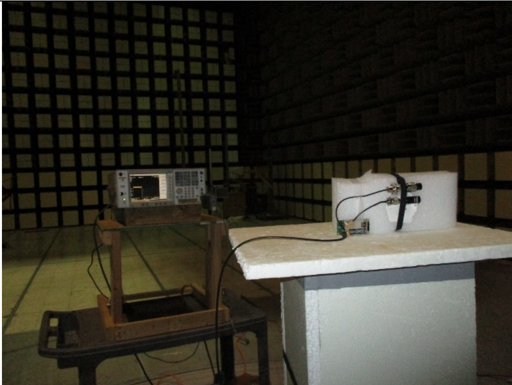
Radiated Emissions to 26.5 GHz