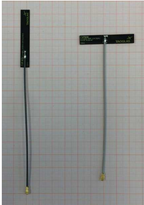
Photo 5: TAOGLAS FXP831.07.0100C (left) / TAOGLAS FXP830.07.0100C (right)