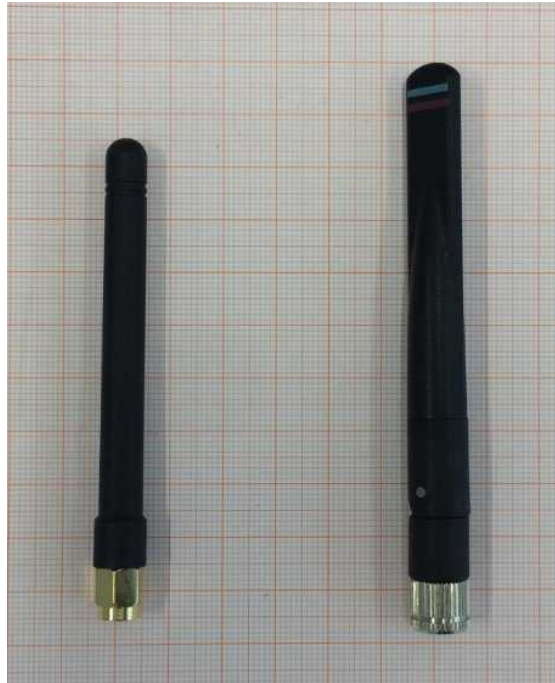
Photo 3: TAOGLAS GW.48.A151 (left) / Linx Technologies Inc. ANT-DB1-RAF-RPS (right)