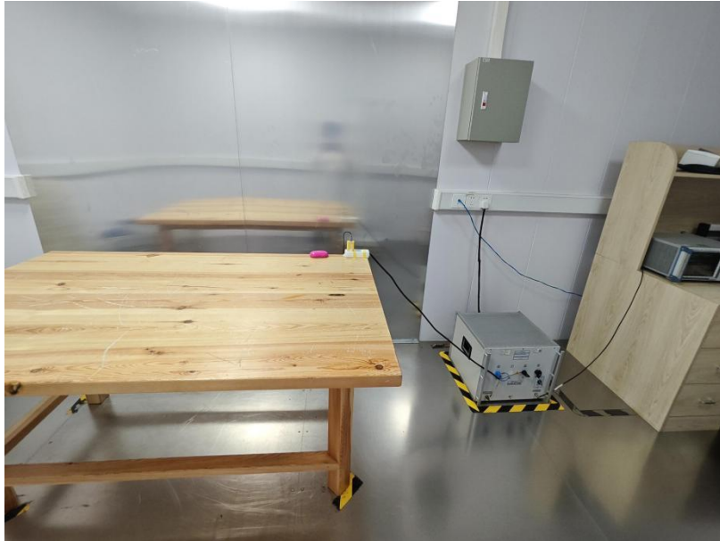
Radiated Emissions From 30M-1GHz