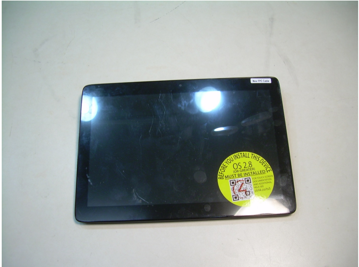
Front View of the Touchscreen