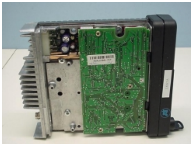
Logic PCB as fitted to chassis, complete unit minus covers