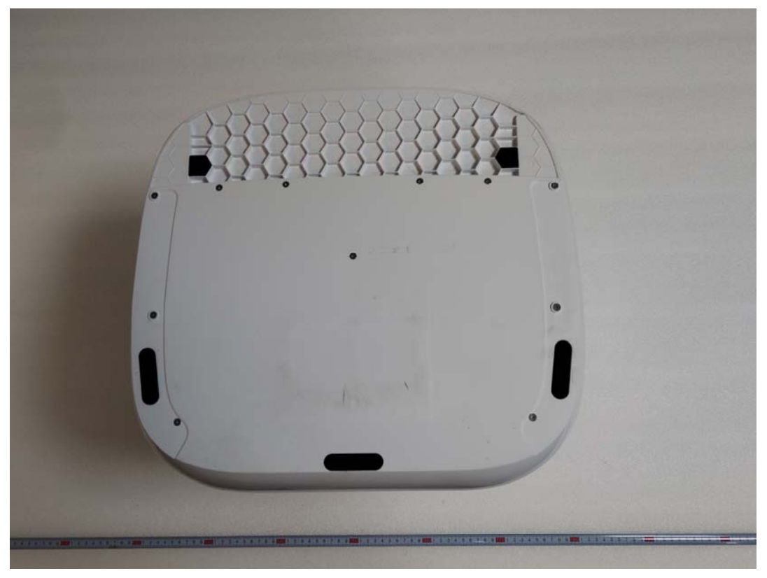
Page 4 of 6