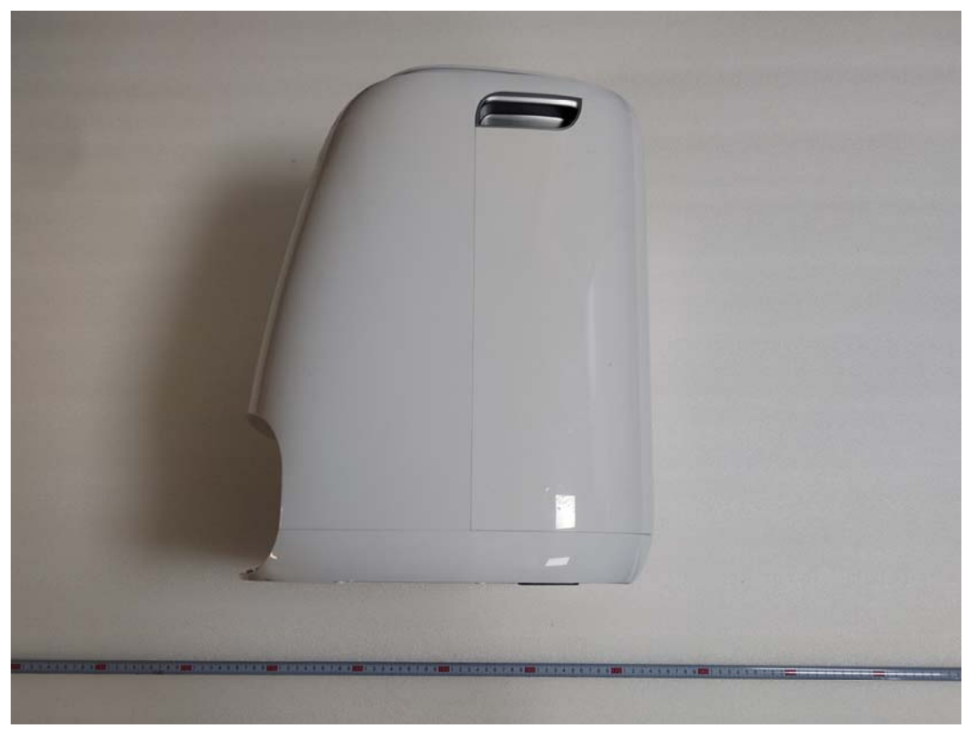
Page 5 of 6