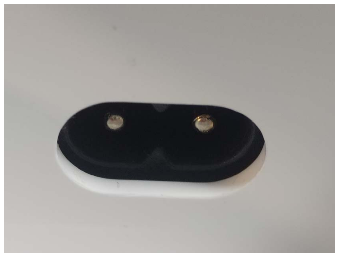
Page 2 of 6