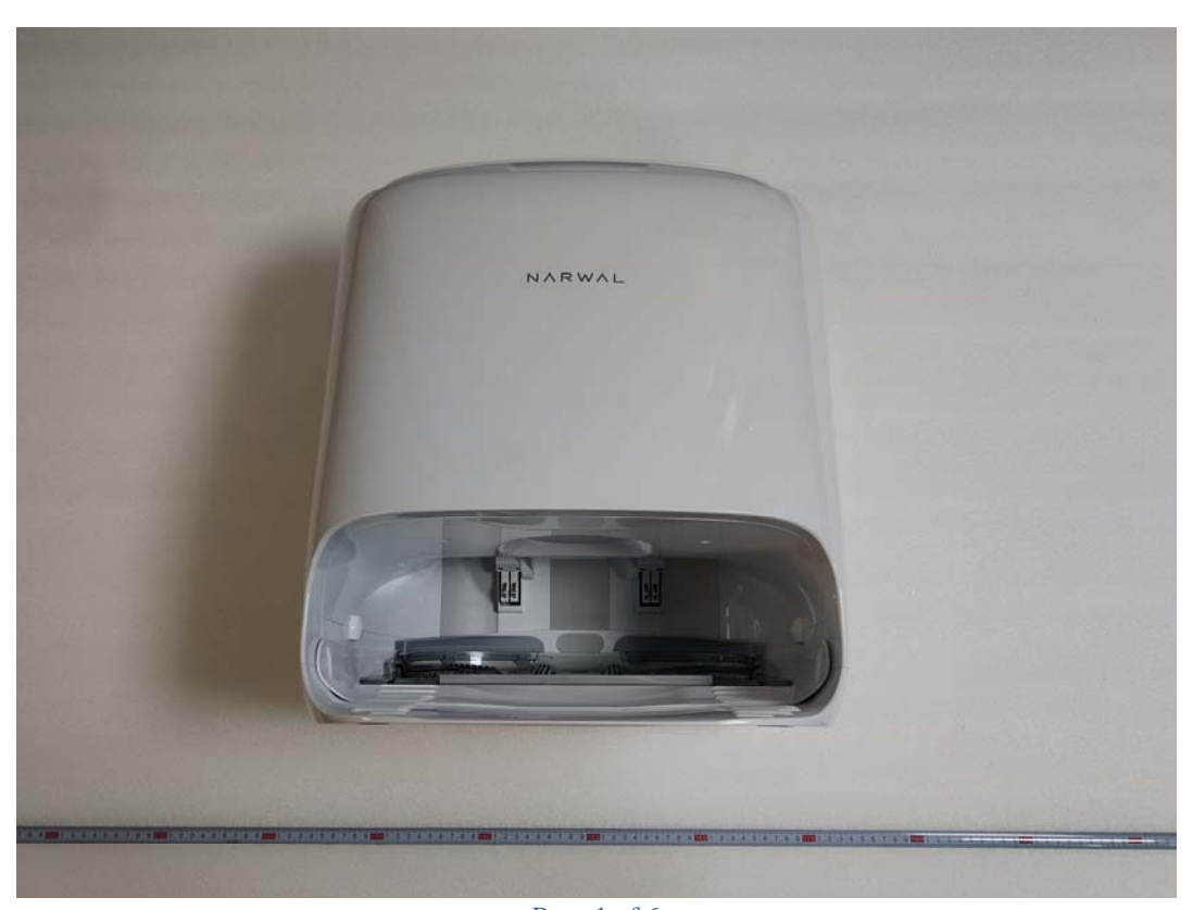
Page 1 of 6