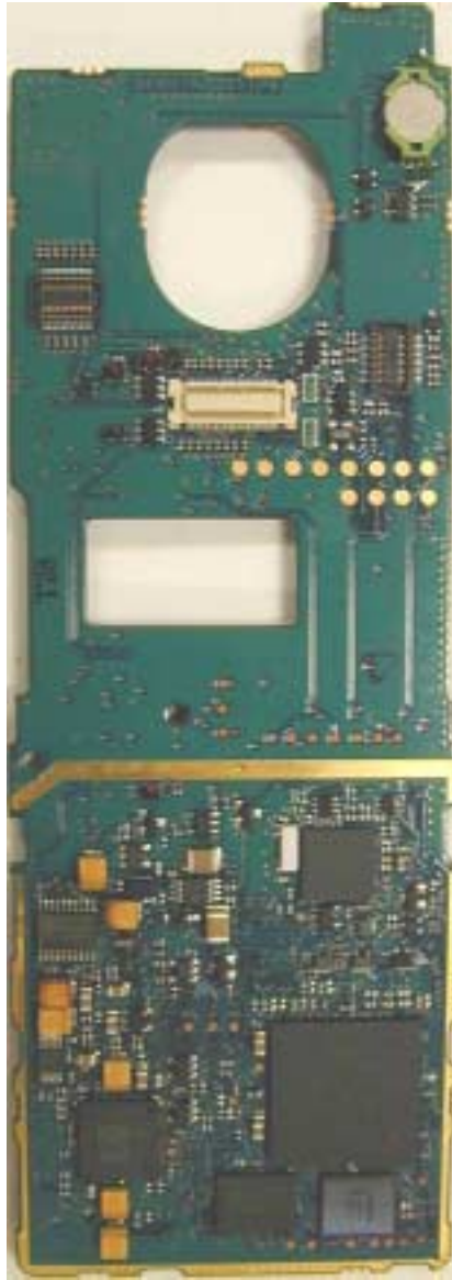
VOCON BOARD (TOP VIEW)