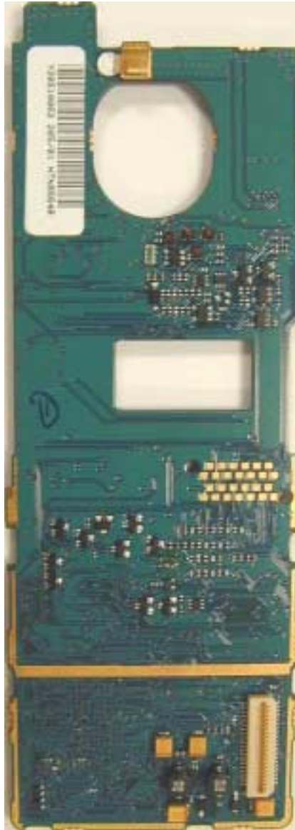
VOCON BOARD (BOTTOM VIEW)