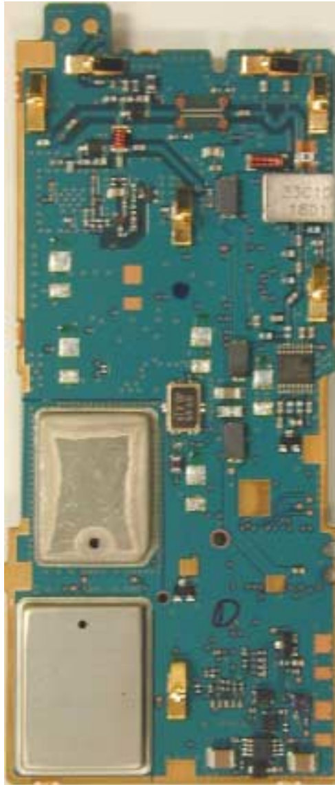
RF BOARD (BOTTOM VIEW)