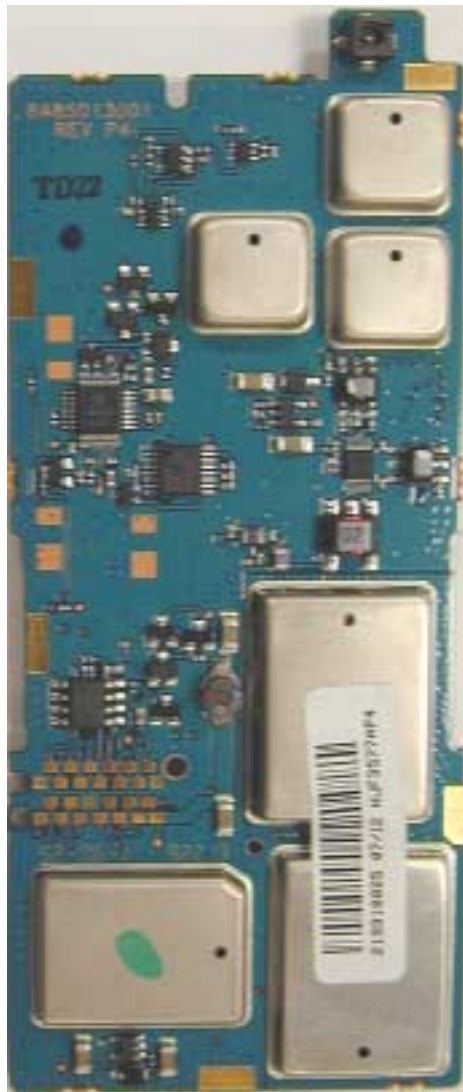
RF BOARD (TOP VIEW)