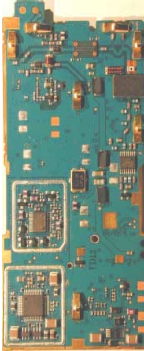
RF BOARD, less shields (BOTTOM VIEW)