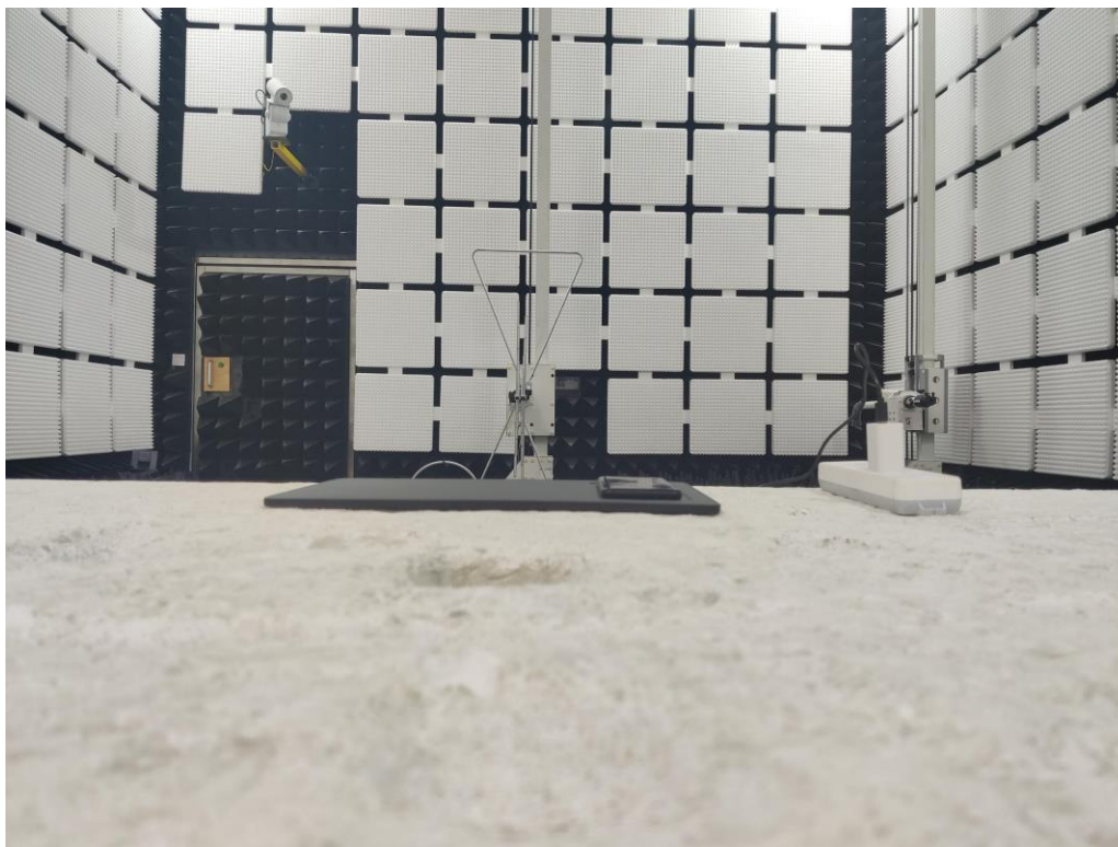
Radiated Emission below 1GHz