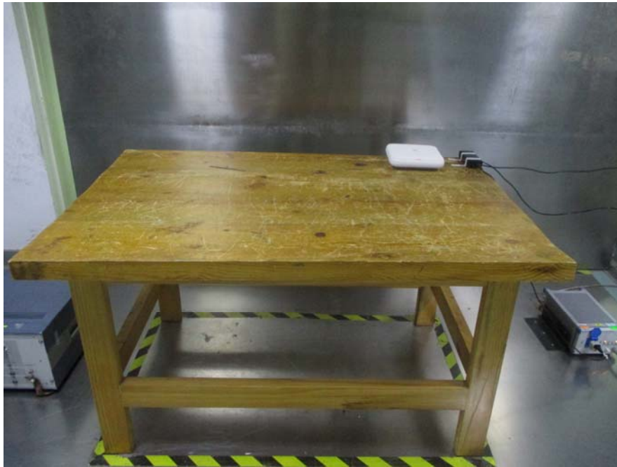
Conducted Emissions – Side View(POE)