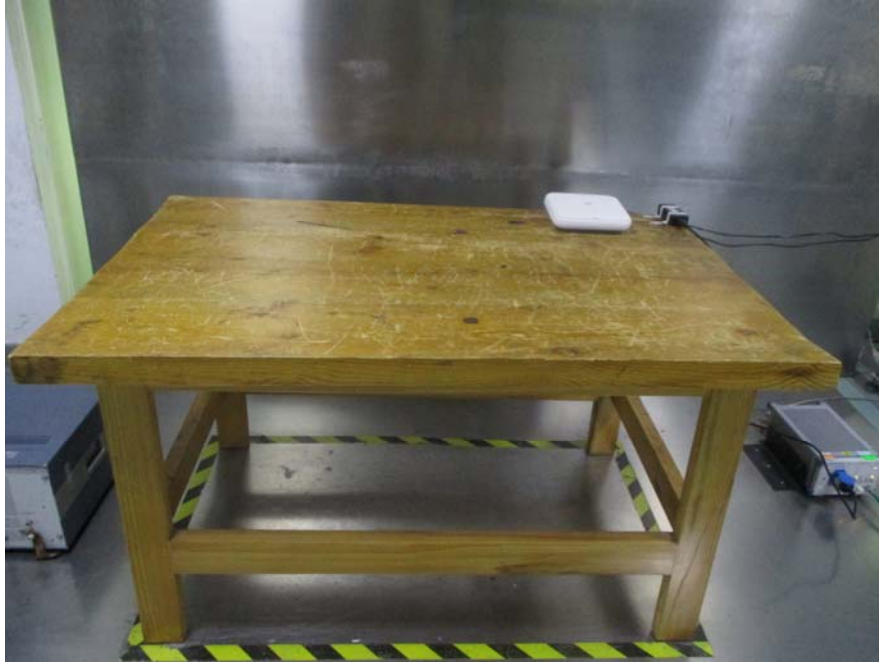
Conducted Emissions – Side View(Adapter)