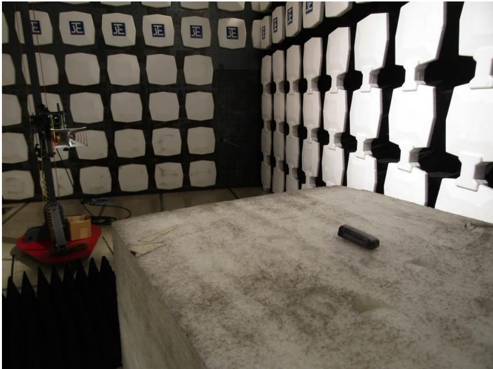
Measurement of Conducted Emission Test Set Up