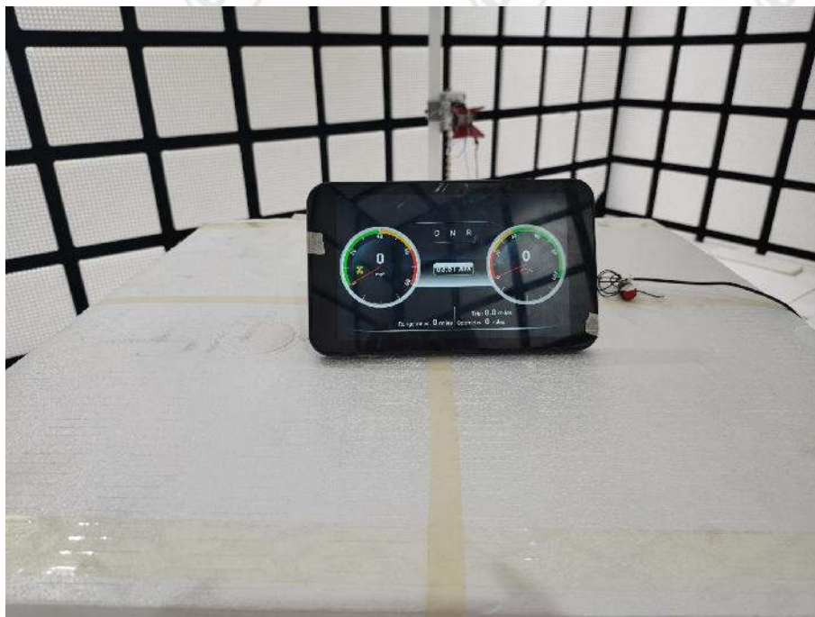
Radiated spurious emission Test Setup-3(Above 1GHz)