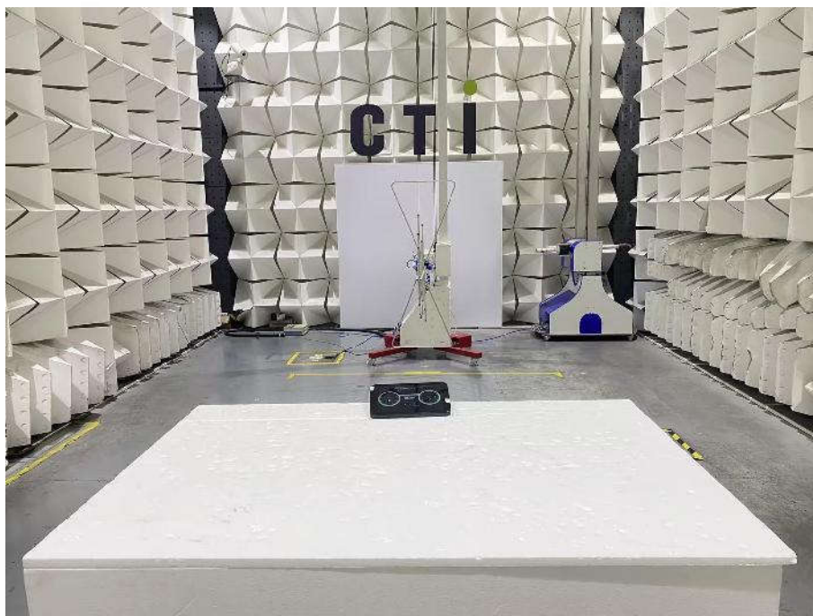
Radiated spurious emission Test Setup-1(Below 1GHz)