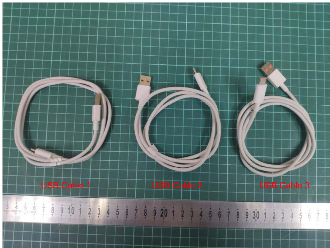
c: USB Cable