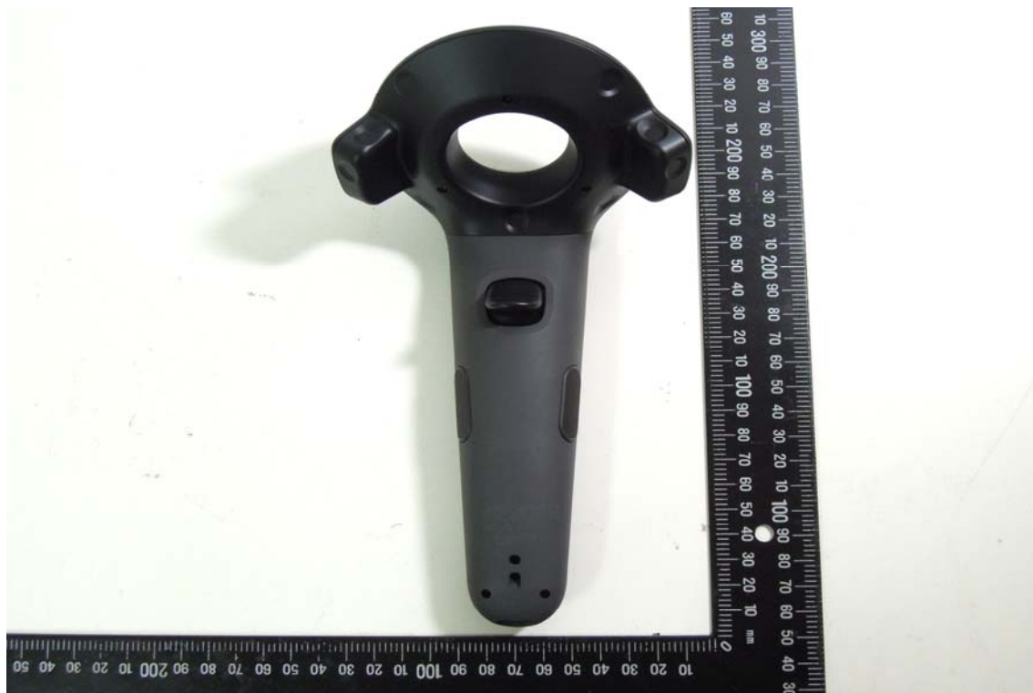
Side View of EUT – 1