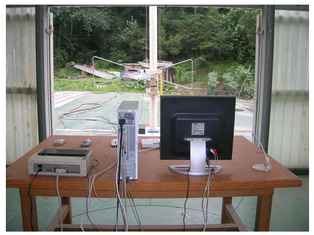
RADIATED EMISSION SETUP PHOTOGRAPH - REAR VIEW