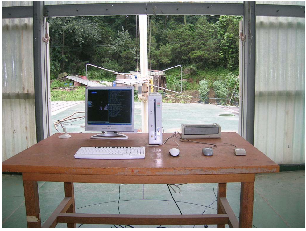
RADIATED EMISSION SETUP PHOTOGRAPH - FRONT VIEW