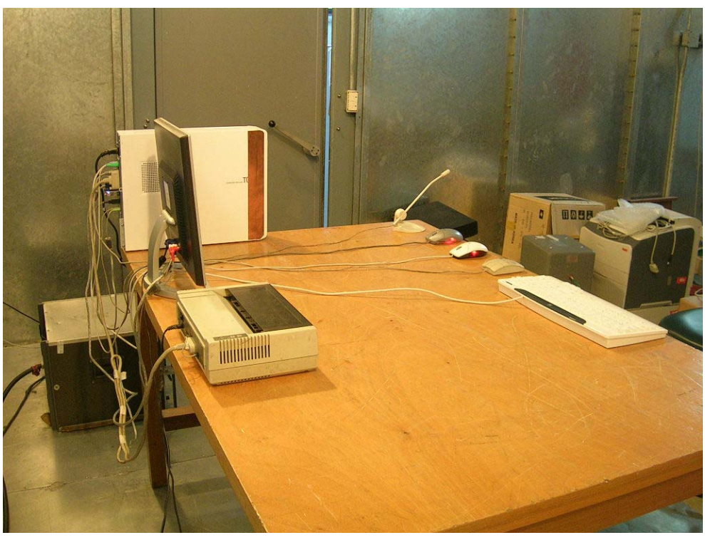
LINE CONDUCTED SETUP PHOTOGRAPH - REAR VIEW