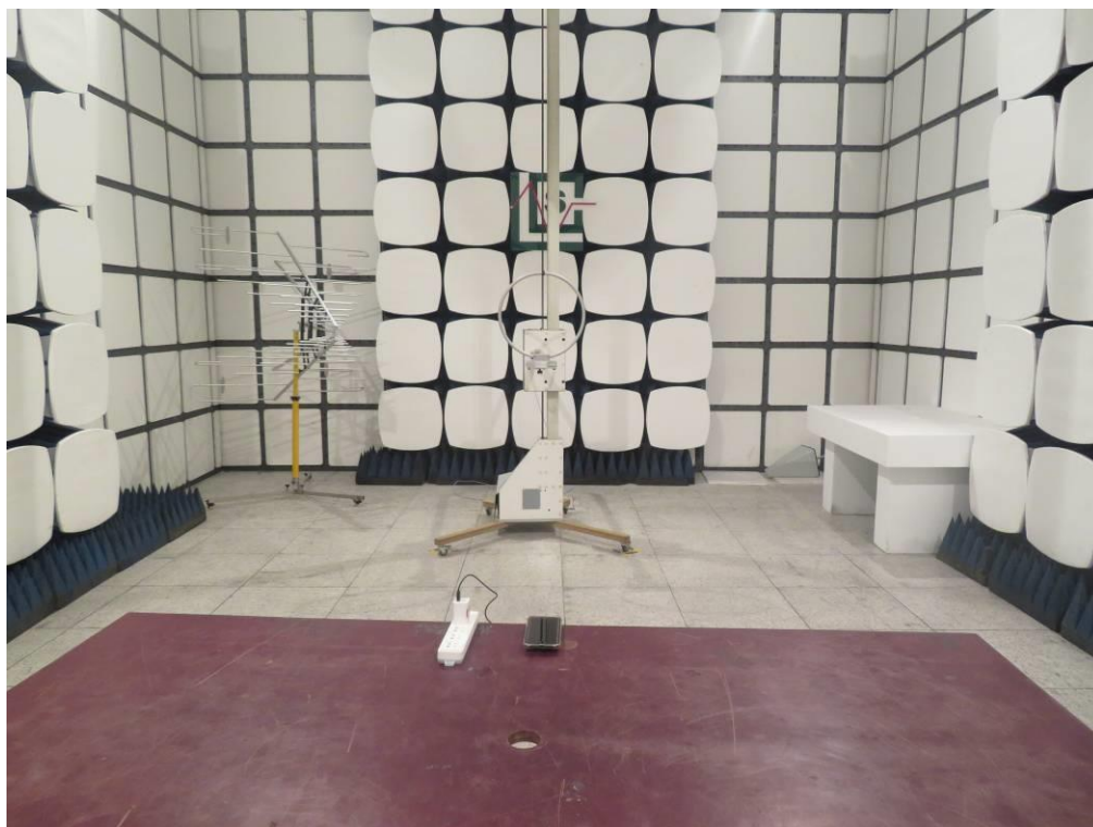
Radiated Emission below 30MHz-AC adapter charge mode