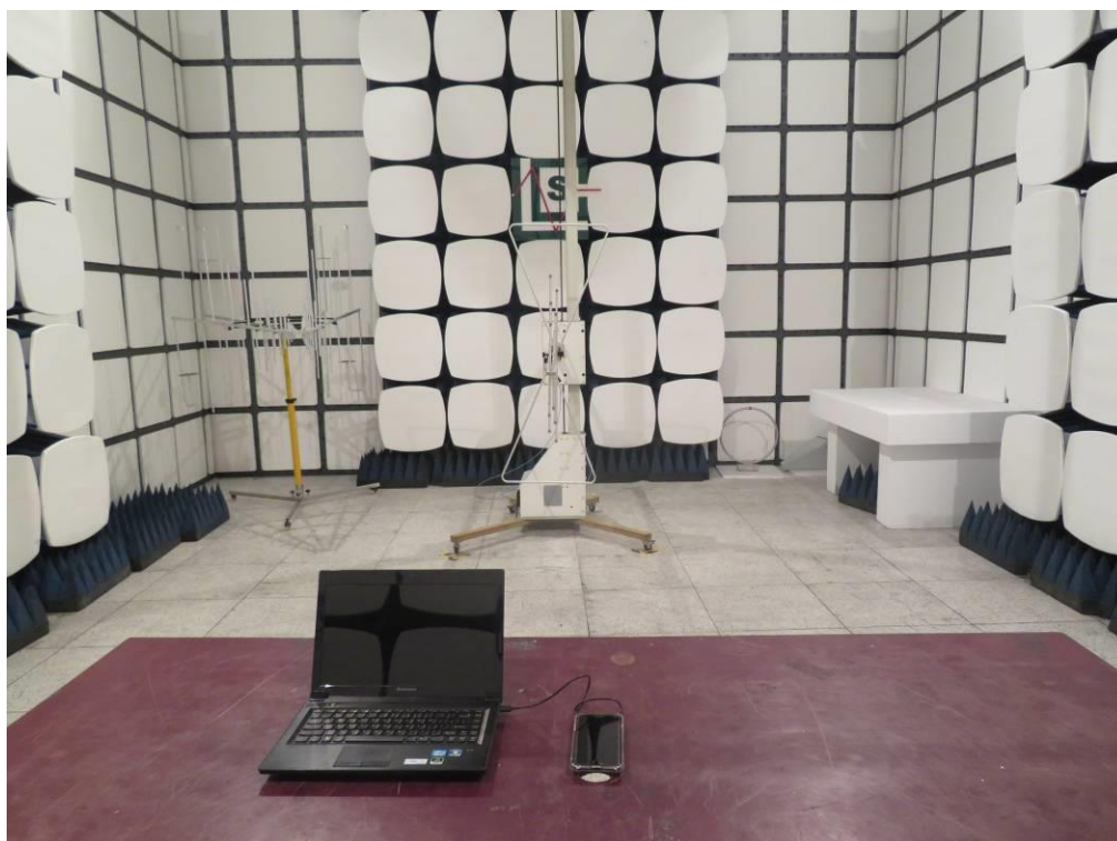
Radiated Emission below 1GHz-PC charge mode