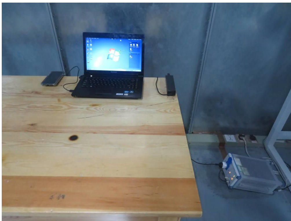
Conducted Emission-PC charge mode