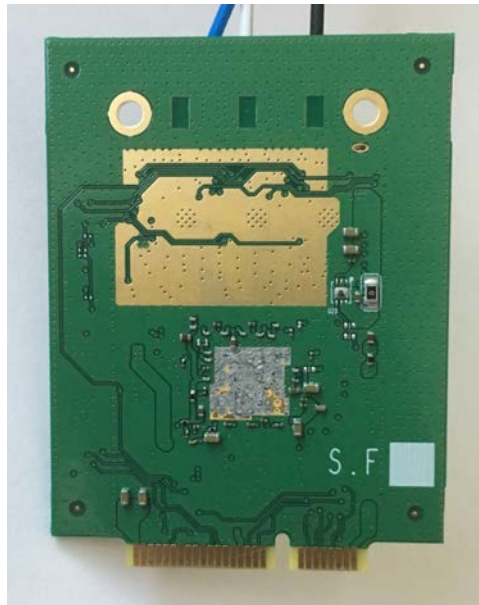
Figure 2 - 802.11bgn/Scanning WiFi Radio Module Bottom View