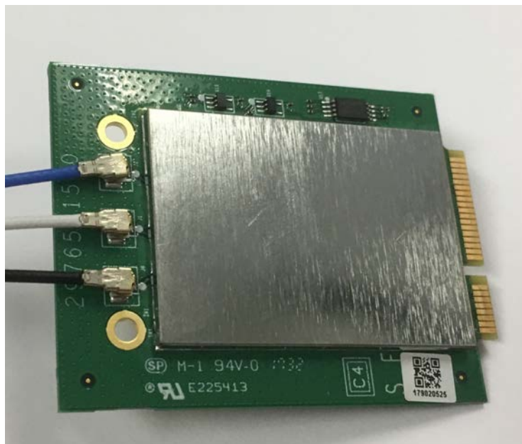
Figure 1 - 802.11bgn/Scanning WiFi Radio Module Front View

The 802.11bgn/Scanning WiFi Radio Module - Top View