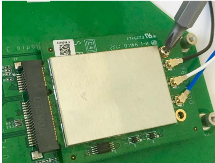
Figure 4 – Secure the 802.11bgn/Scanning WiFi Radio Module in to the PCIe card

Using a #1 Phillips Screw Driver, secure the 802.11bgn/Scanning WiFi Radio Module to the PCIe Adapter using two M2.5 Screws..