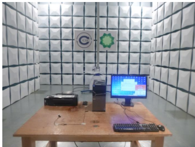
Radiated Emission (above 1GHz) Connect to PC