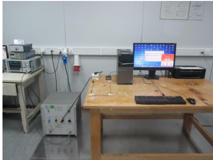
Radiated Emission (30MHz-1GHz) Connect to PC