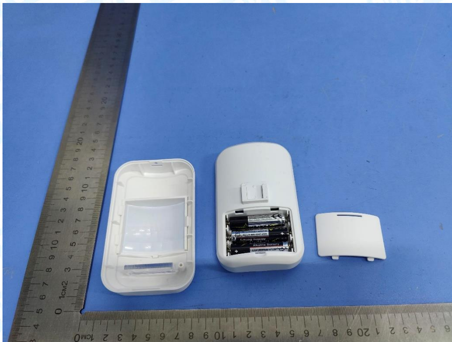
Photo 8 Internal of EUT