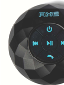
Wireless Shower Speaker