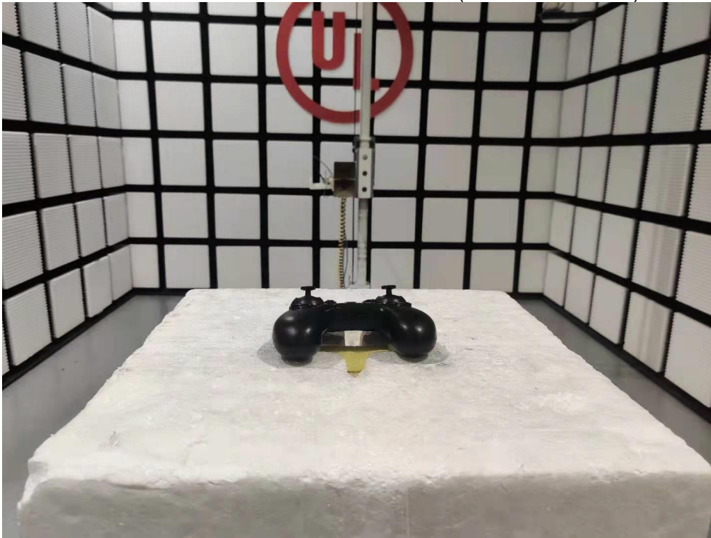
RADIATED RF MEASUREMENT SETUP (Above 1G – Y axis)