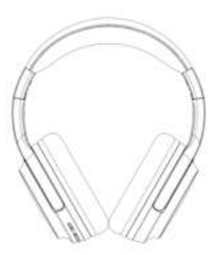
ANC Wireless Headphones Quick Start Guide Model JHM-B1