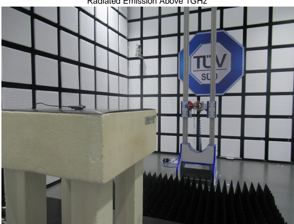
Radiated Emission Above 1GHz