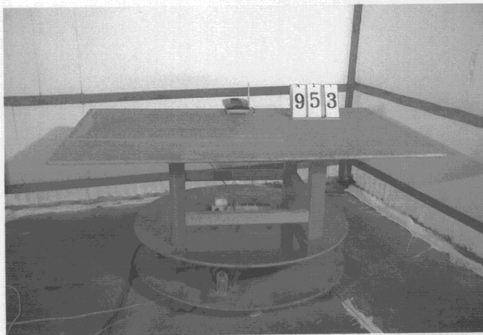
Pig 1 Front View of the Test Configuration ( BASE )