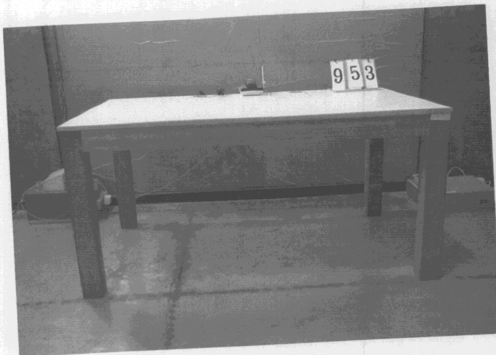
Fig. 3 Conducted emissions test placement (idle only)