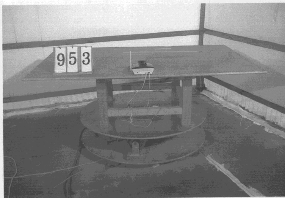
Pig 2 Rear View of the Test Configuration ( BASE )