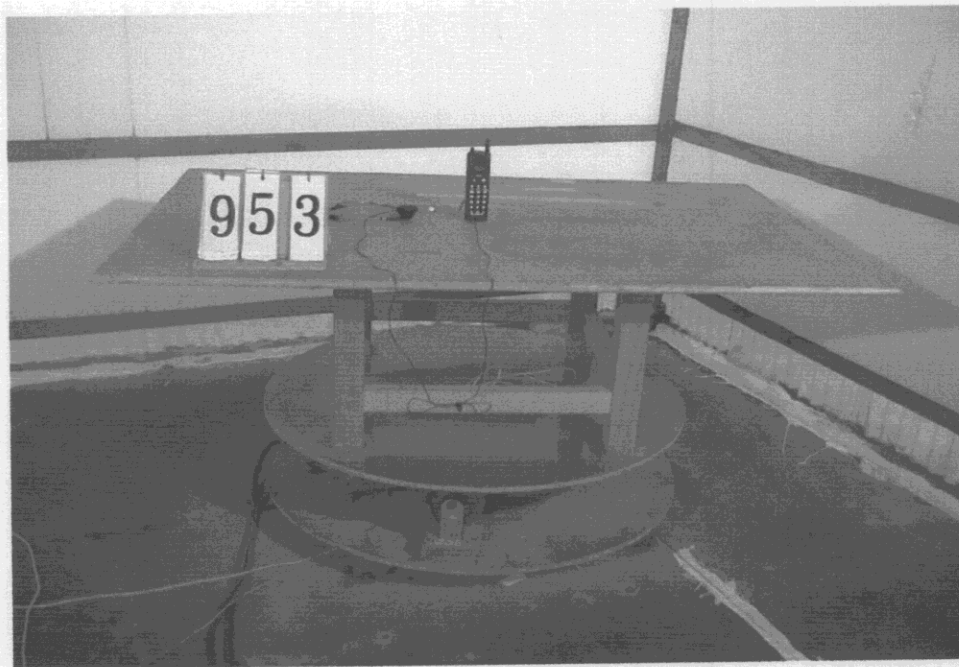
Pig 1 Front View of the Test Configuration (HANDSET)