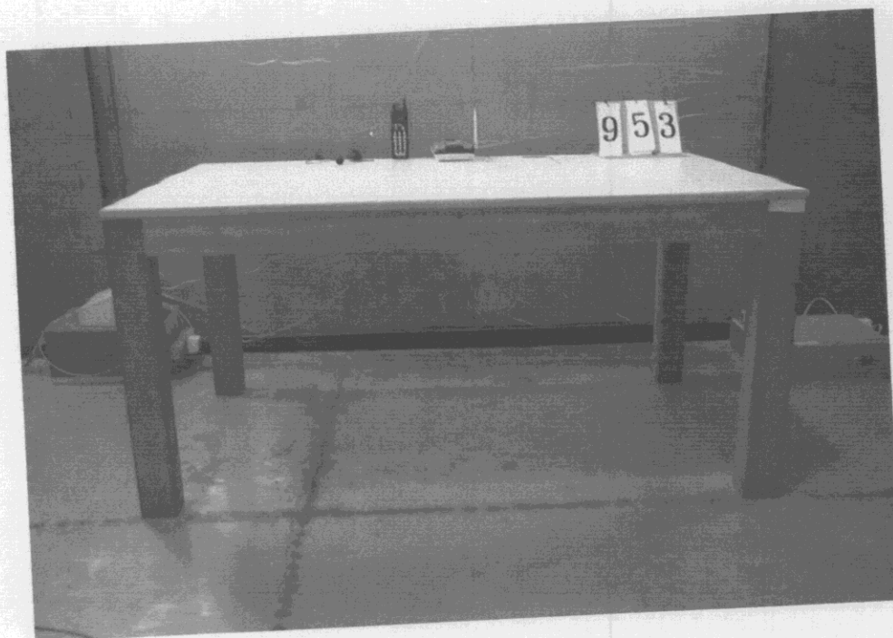
Fig. 4 Conducted emissions test placement (operating only)