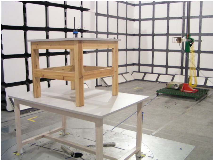
Radiated Emission - Rear View (Above 1000 MHz)