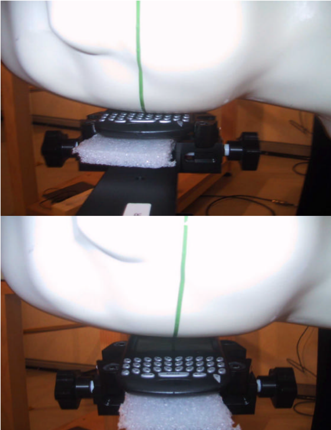
Figure E2. Right ear configuration