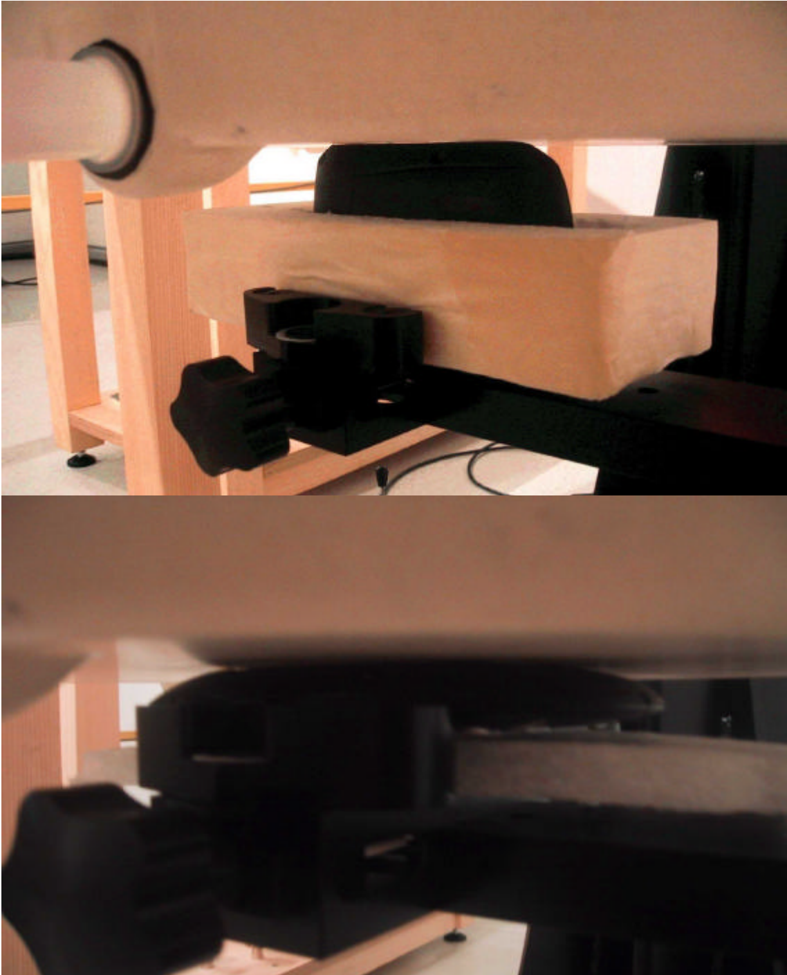
Figure E4. Hand SAR configuration, unit left edge and back touching flat phantom