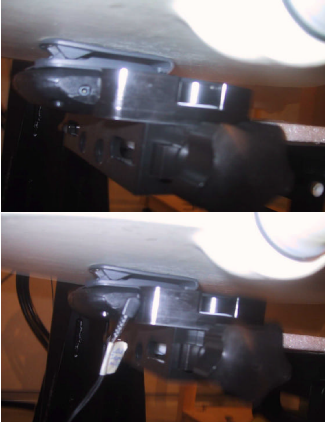
Figure E3. Body worn configuration with holster and headset