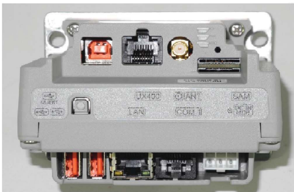
UX301 Underside View