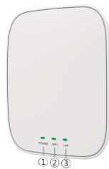
Figure 1: Front Panel