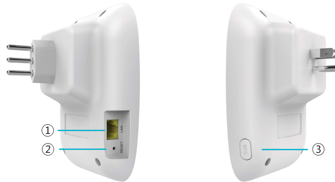
Figure 2: Side Panel