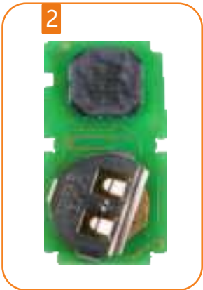
Take the battery out and replace new one

Note: The battery type is 2032 with 3V, ensure the positive and negative of battery is correct