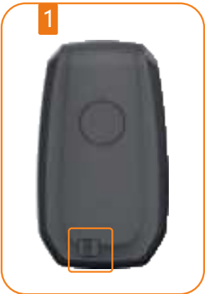
Push the slide button to separate the shell

First use or when the battery runs out need to change new battery, following steps: