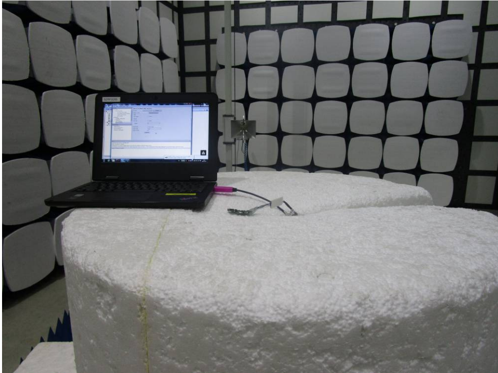
1.4 Radiated Emissions which fall in the restricted bands Tset setup.