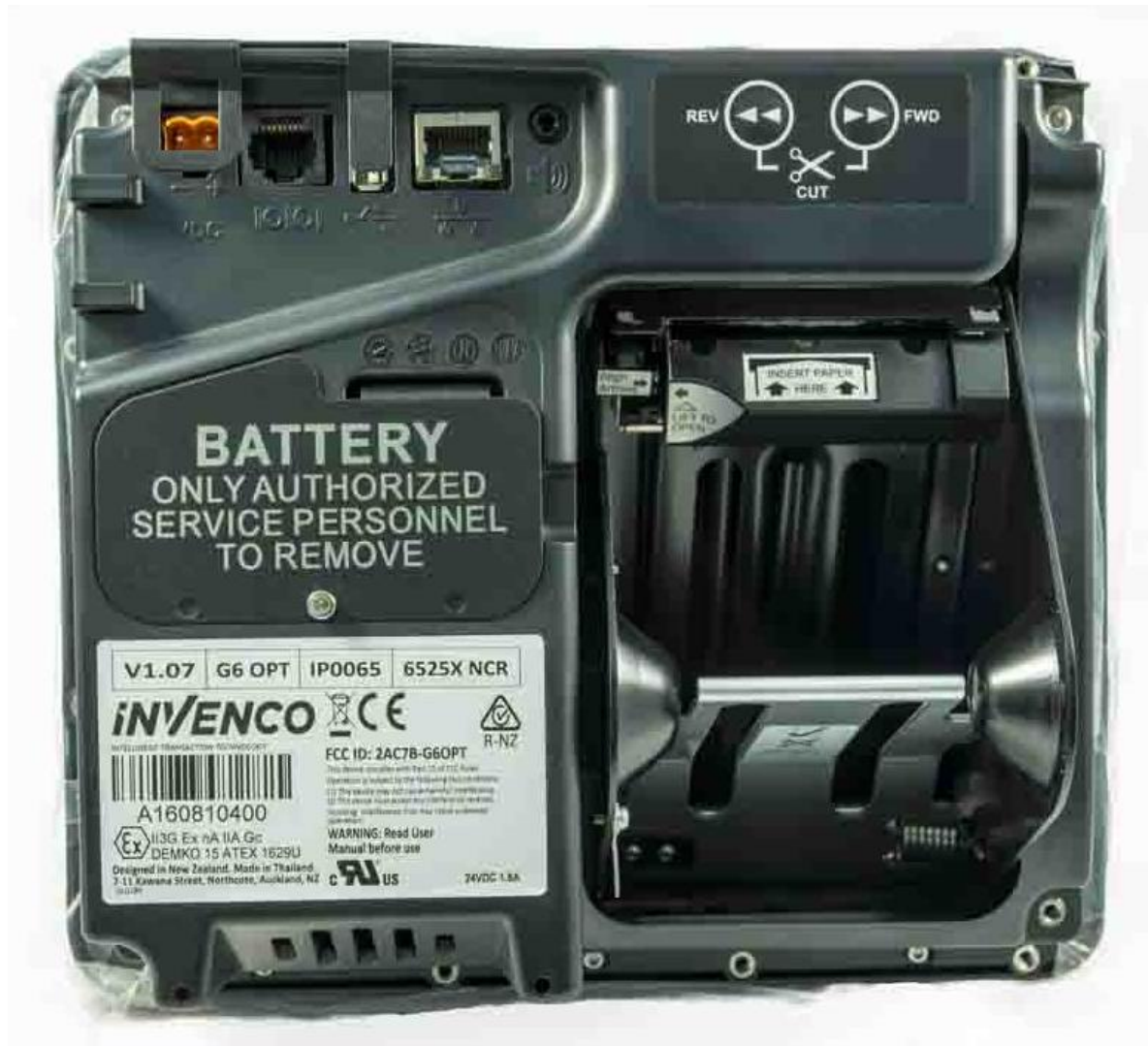
Figure 2 Assembled unit viewed from the back