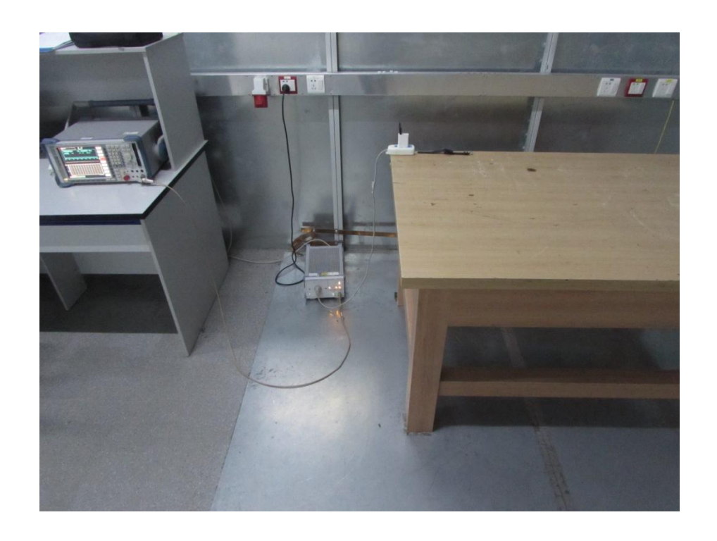
RADIATED EMISSION TEST (Frequency from 30MHz to 1GHz)