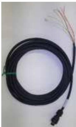
(a) Connector type: Straight

Figure 2 shows a photograph of the main cable (including the power cable and RS-485 full-duplex communication cable) to be connected to the JRC-M's RADAR SENSOR.