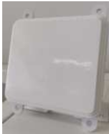
Figure 1: JRC-M's RADAR SENSOR

Figure 1 shows a photograph of JRC-M's RADAR SENSOR.