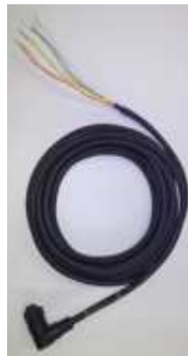
(b) Connector type: Right Angle