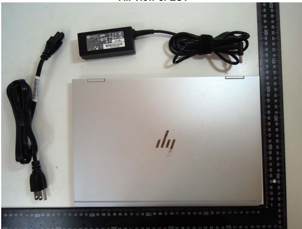
Front View of EUT - 1