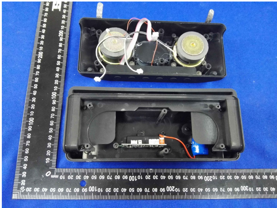
The EUT-Inside View