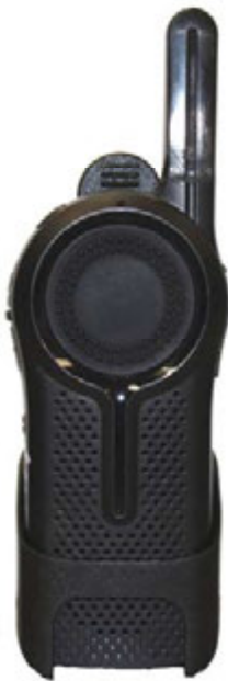
DUT Front View Belt clip with Holster HKLN4616A