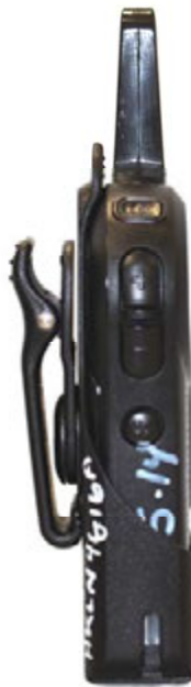
DUT Side View Belt clip with Holster HKLN4616A