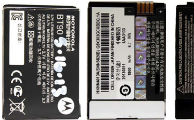
Left – Right; Front, back and side views: HKNN4013A