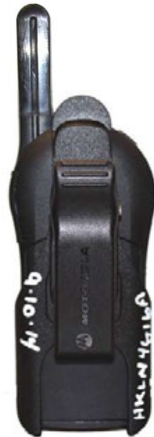
DUT Back View Belt clip with Holster HKLN4616A