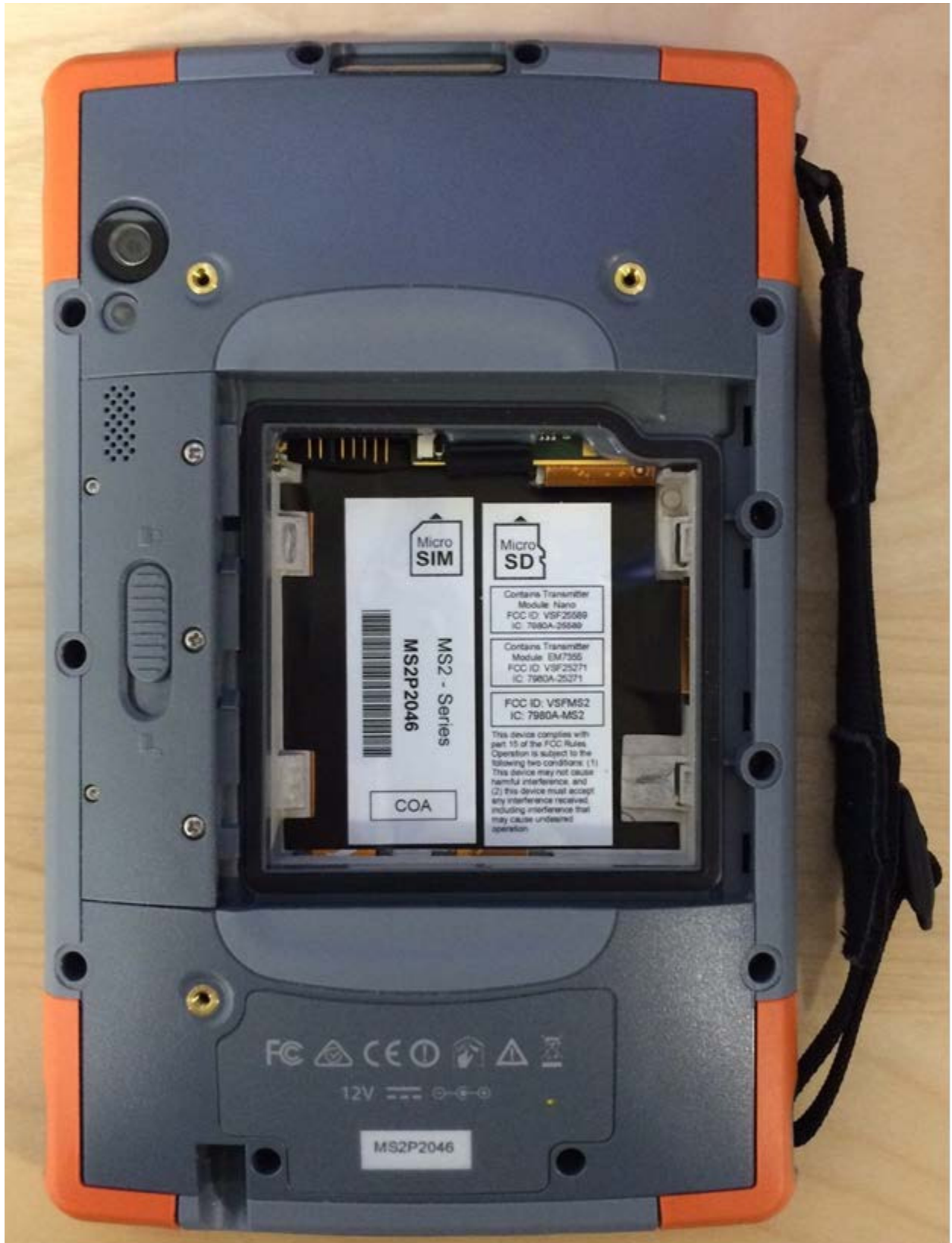
Figure 3: Sample Label Location