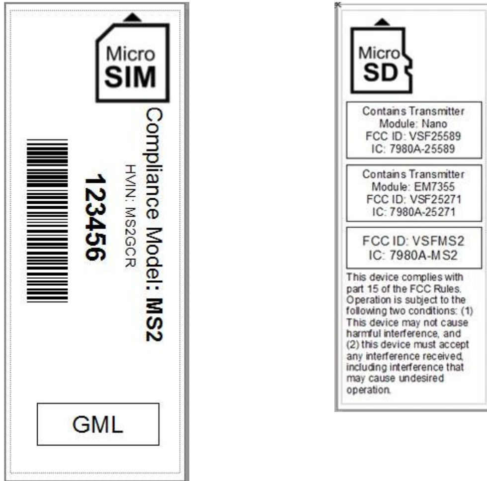
Figure 2: MS2GCR - Label