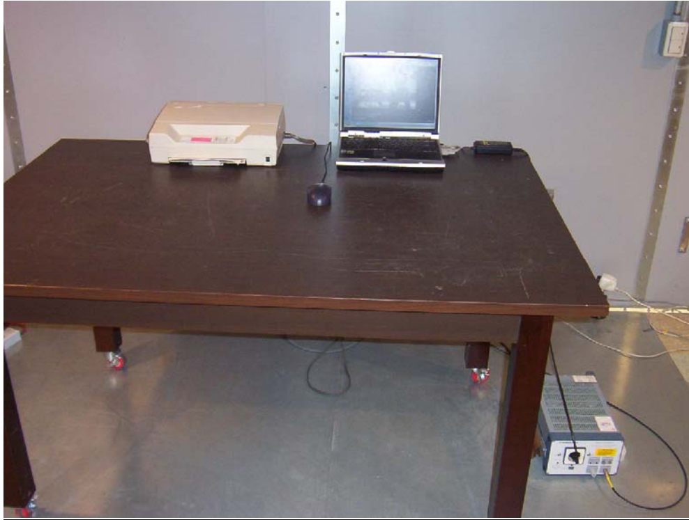
Conducted emission test (Rear)