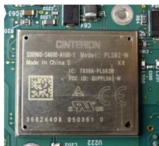
Cellular Module Gemalto PLS62-W

DCTU Circuit Board (Bottom View): P/N: MFAST-A-013-2, Schematic P/N MFAST-S-015-2