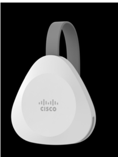
Figure 1. Cisco Webex Share

The Cisco Webex Share revolutionizes the way we work by combining key requirements for team collaboration in the physical meeting room into a single device and connects it to the cloud for continuous workflow.