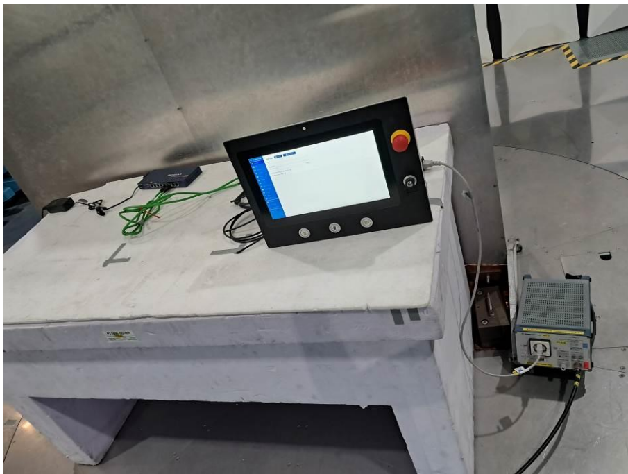
Figure 6-1: test setup Low voltage AC mains continuous disturbance