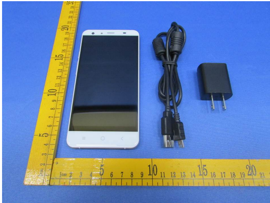
EUT –Model Zen Element 2nd Gen External View