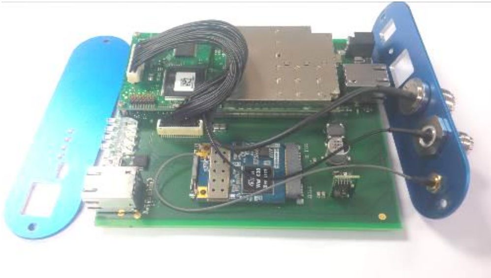
Figure 1 – Casing removed

Note: Wi Fi module is shown but not yet incorporated within this product.