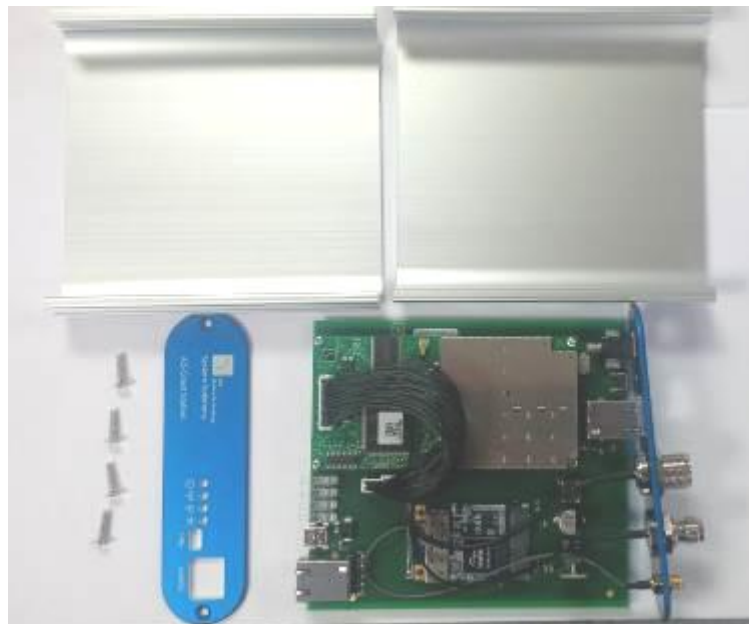
Figure 2 – Dismantled view

Note: Wi Fi module is shown but not yet incorporated within this product.