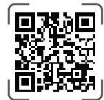
Govee Home App

For FAQs and more information, please visit: www.govee.com