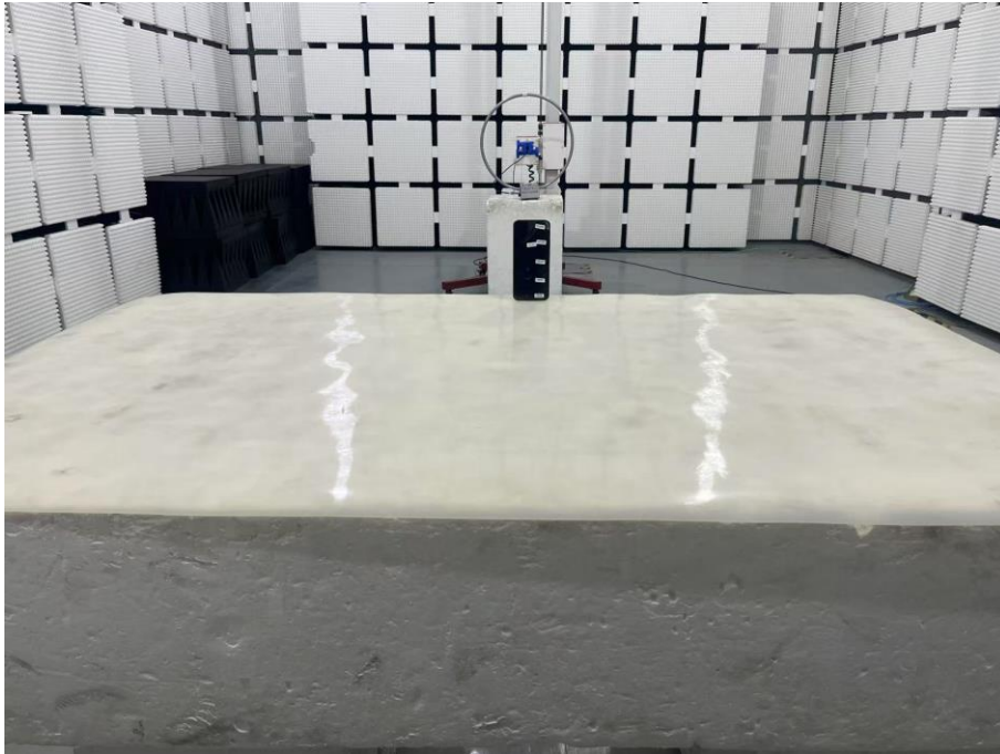
Set-up for Transmitter & Receiver Spurious Emissions, 30MHz to 1000MHz