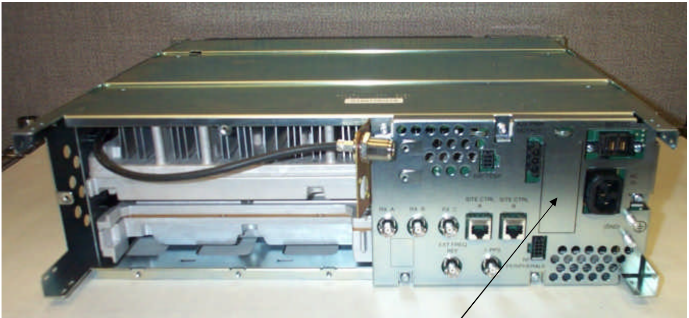
Location of FCC ID Label

The location of the FCC ID label is on the back of the radio, as shown in the photograph below.