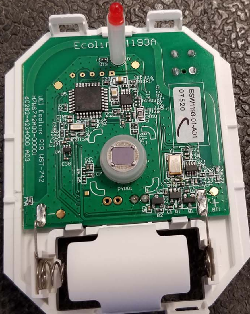
Top View of the PCB - View #1