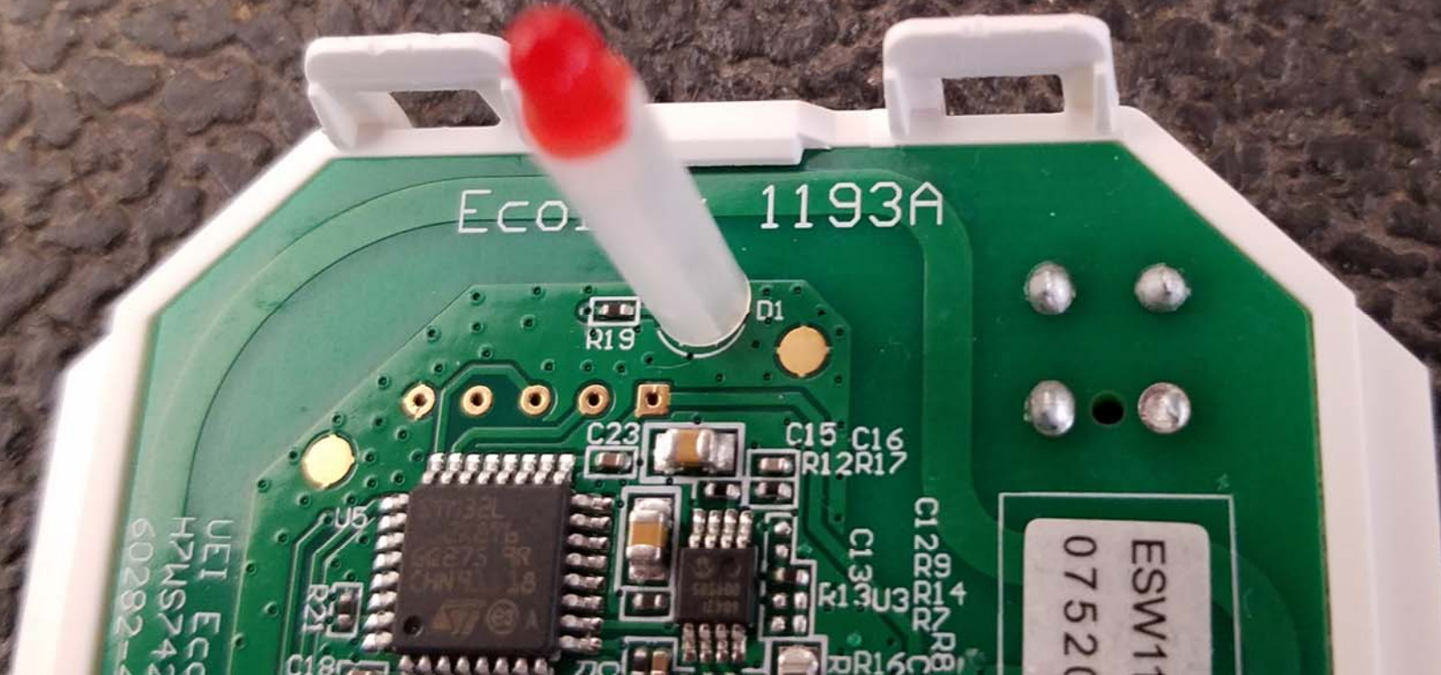
Top View of the PCB - View #7