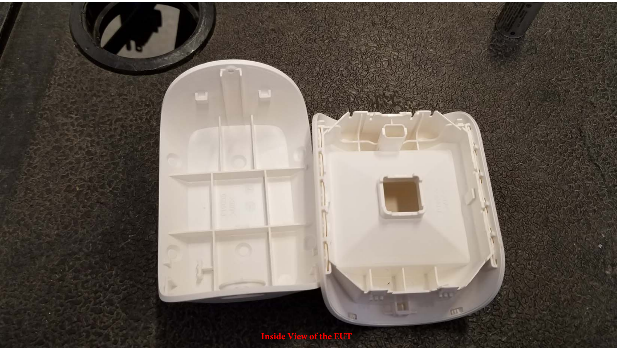
Inside View of the EUT