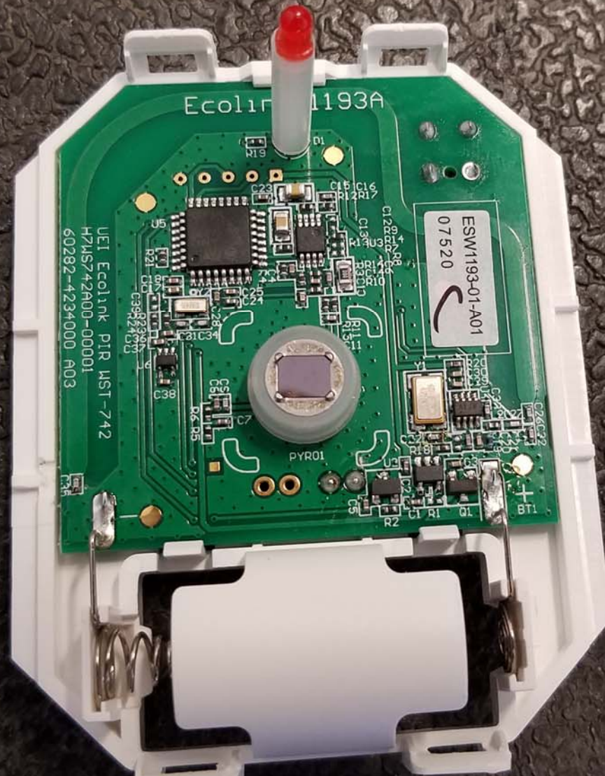
Top View of the EUT - View #2