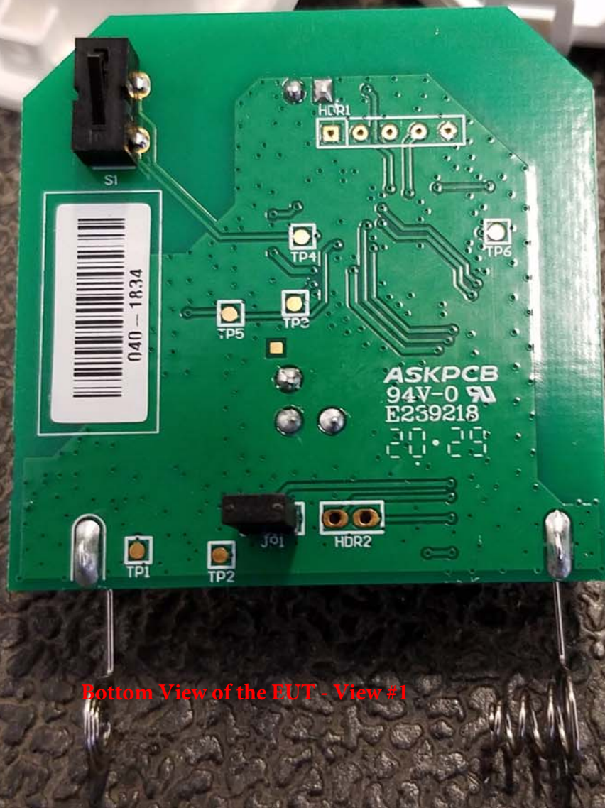
Bottom View of the EUT - View #1