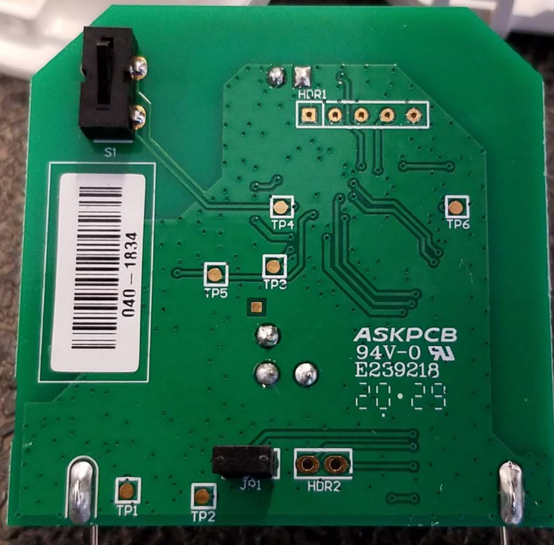
Bottom View of the EUT - View #2