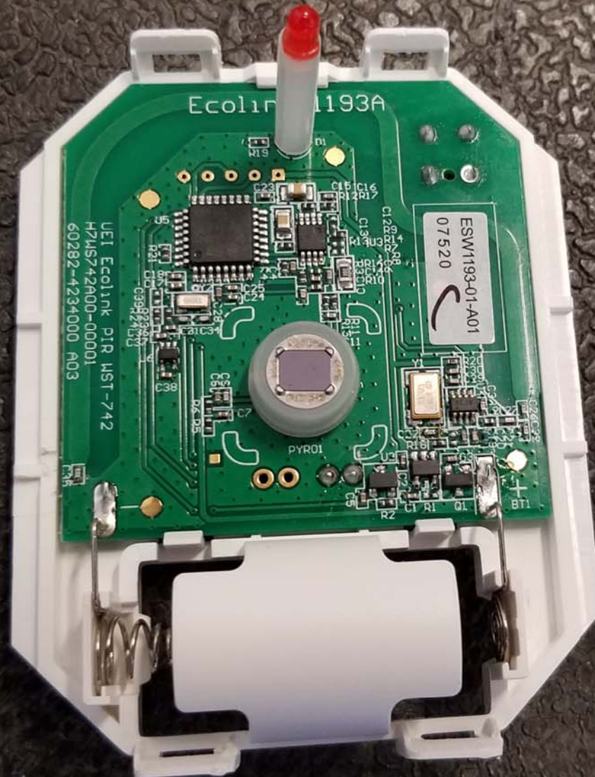
Top View of the EUT - View #3